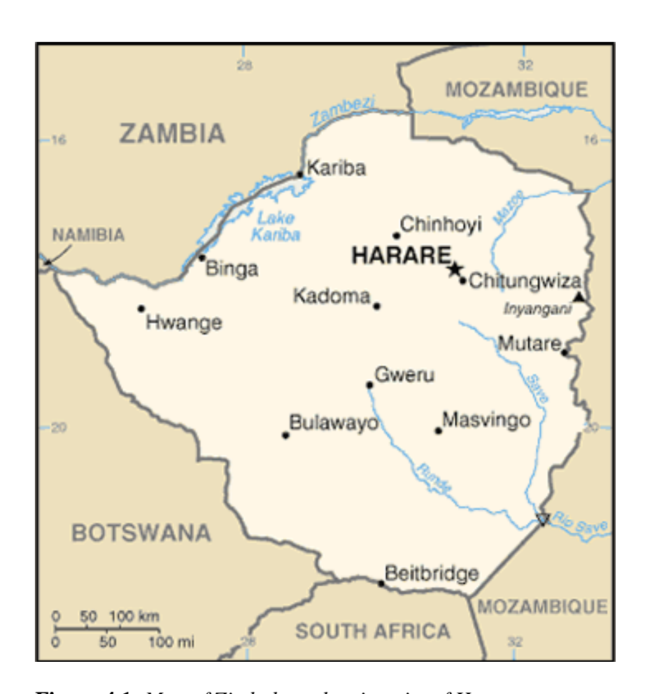
Figure 4.1: Map of Zimbabwe showing city of Harare

The market that is the subject of this study is situated in Harare, the capital city of Zimbabwe which is located in the north east of the country (Figure 4.1).