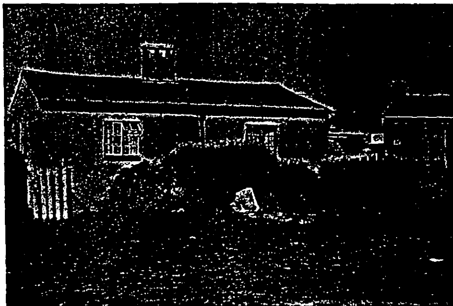
Fig. 2. A House in McNamee Village