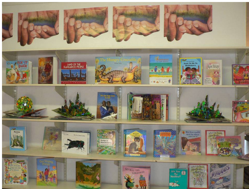
Plate 2: Picture book display at library entrance