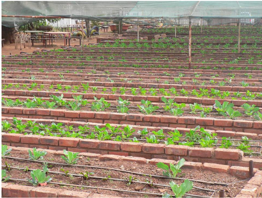
Plate 1: Raised vegetable beds