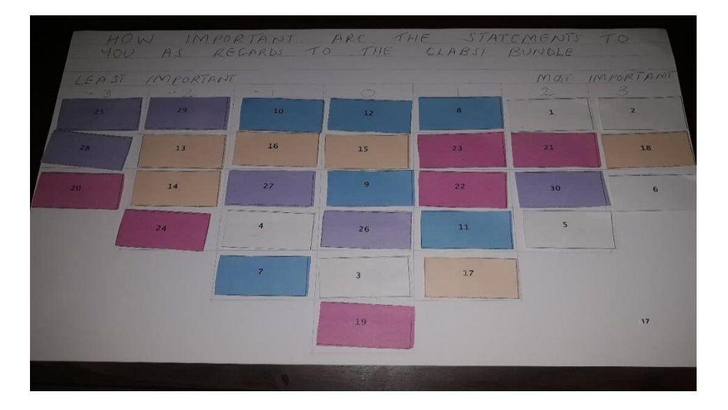
Figure 3.2 – Completed Q sort diagram with numbers side