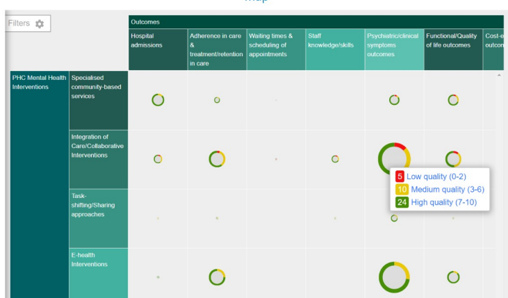
Strategies to strengthen provision of mental health care at primary care level: an evidence map

There is much evidence on strategies that empower families, carers and patients: integration of care/collaborative interventions, and e-health interventions. These strategies have been