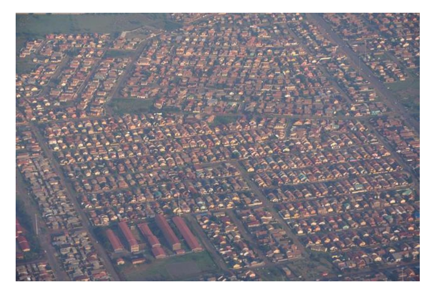
Figure 2 depicts the map of Vosloorus and its sub-places

Vosloorus is an area which was under the Boksburg municipality before it gained its own municipal status. It was founded in the 1960s for the Black racially categorised workers which previously resided in Juwele. The first few sub-places were Nguni section and Sotho section which under the apartheid government were meant to divide the black population according to their ethnicity. Currently 99% of the residents are Black racially categorised people (Census, 2011).