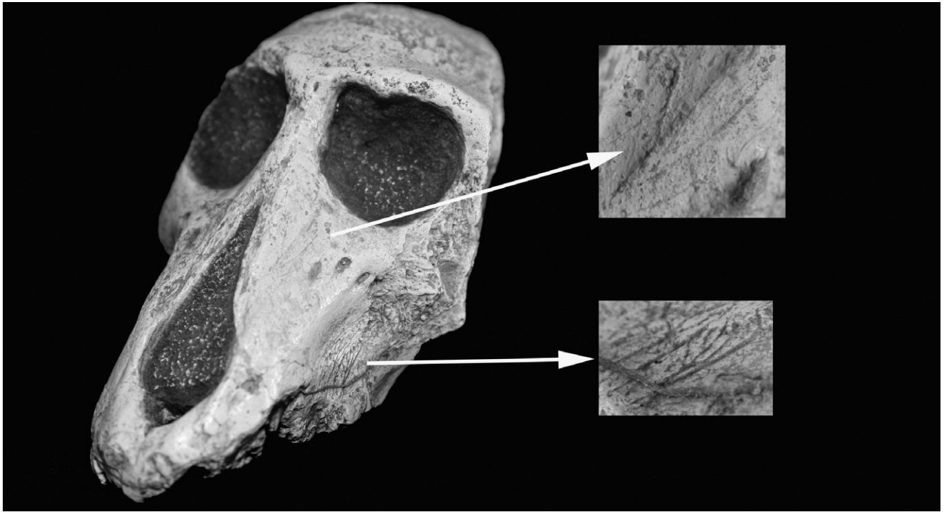
Fig. G. Another fossil monkey from Taung (TP 65) with scratch marks on the face. Note that the position and frequency are comparable with those found on modern monkeys illustrated in the main article. It is not known whether these fossil monkey specimens were ever prepared by Dart or others, or if they were recovered from the blasting complete.