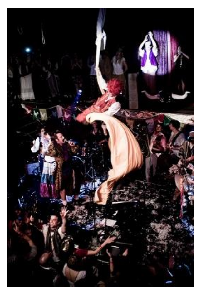
Figure 3. Gypsy dress: fake moustaches. Picture taken at a party in Cape Town, June 2010

Men at the parties wear fake moustaches in a comic way, as a sort of a parody of what moustaches represent in the Balkans. The reference I notice is that of Borat, who himself wears thick, prominent moustaches. For Ma'or: "Nothing is too cool and nothing is too stupid. In fact, the more stupid, the better!" (Nevitt interview, 2010)