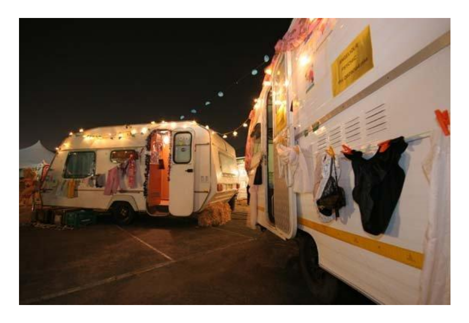
Figure 2. Balkanology's décor: a hung washing line. Picture taken at a party in Cape Town, April 2010

A further sign of rural life is a washing line hung with washing across the venue. At the parties, the washing is randomly hung and there are more underwear items and socks hung than any other clothing items. The guests are free to use them as props as well. In fact, I saw a guest who had put on a pair of red knickers over his jeans. The humour implied by having underwear hung at a party and guests trying it on, signifies the sense of parody integral to Balkanology. Again, the references are drawn from films like Borat, Black cat, white cat and Underground . Balkanology parties reference a caricatured Balkan or an Eastern European man, the free and passionate life of Balkan gypsies and the absurdity of 'Balkan mentality', as explained in chapter three.