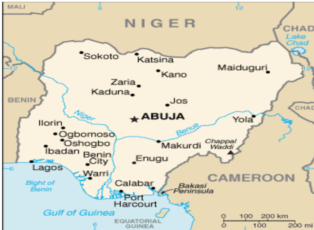
Fig 1: Map of Nigeria