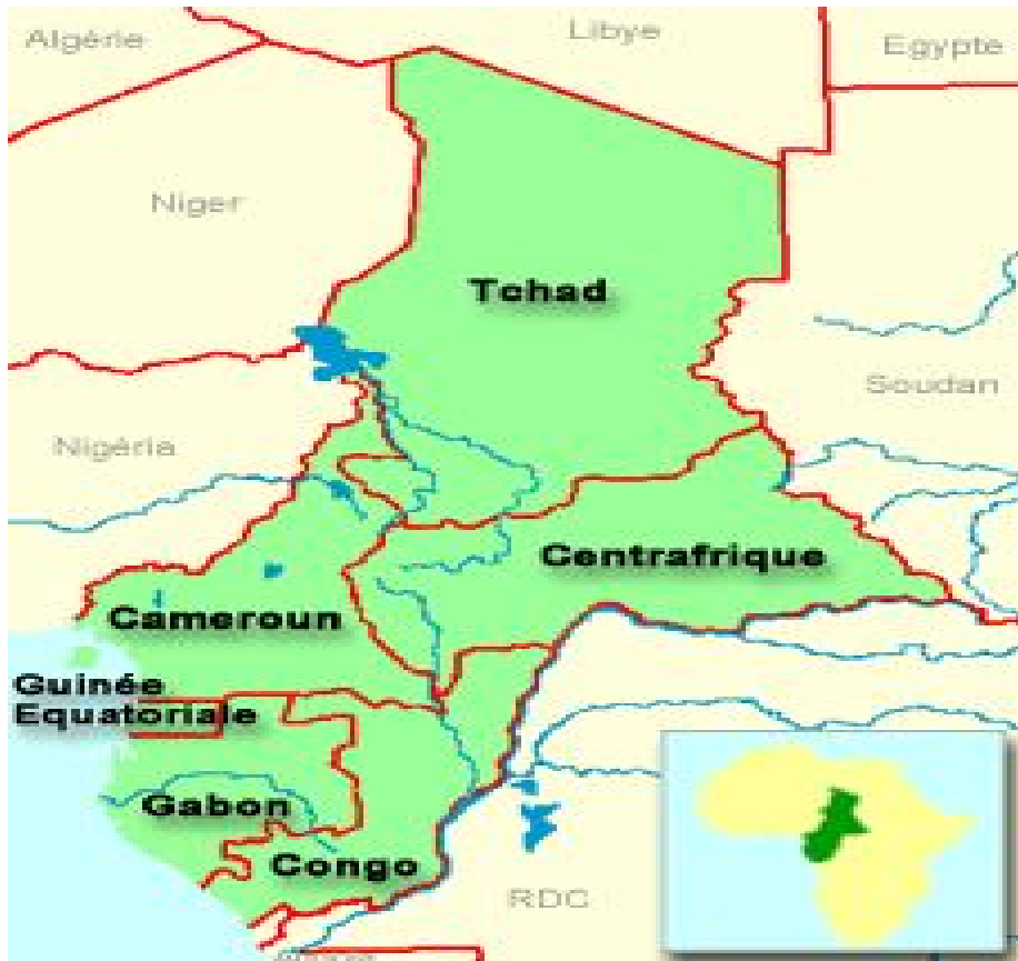
Figure 4.1: Map of Central Africa highlighting CEMAC member states